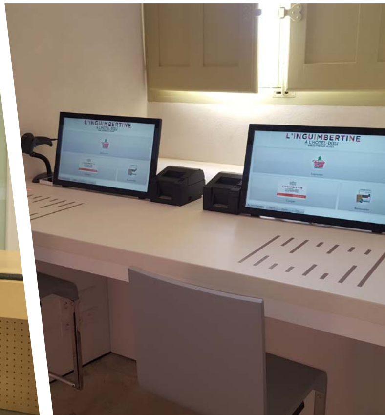
selfCheck™ components RFID