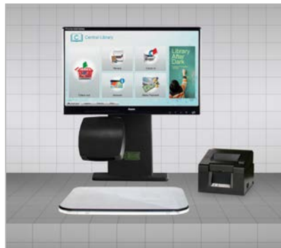
selfCheck™ components RFID version 1 (mounted)