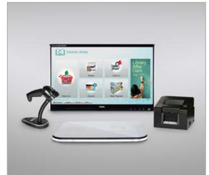
selfCheck™ components RFID version 2 (unmounted)