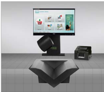
hybrid selfCheck™ components version 1 (mounted)

Our flexible solution can be configured to your exact specifications, allowing self-service operation in barcode, RFID or hybrid mode.