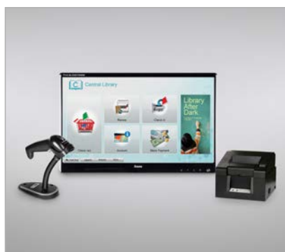
selfCheck™ components barcode version 1 (unmounted)