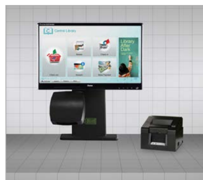
selfCheck™ components barcode version 2 (mounted)