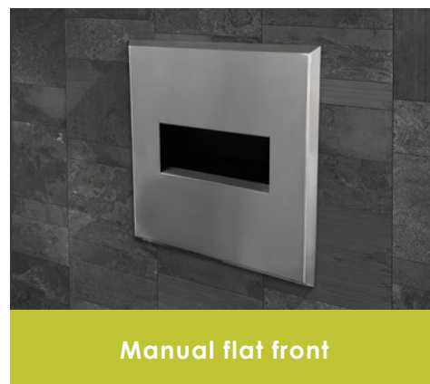
Manual flat front