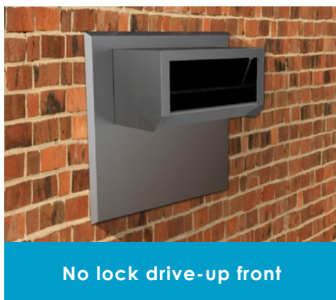
No lock drive-up front

Whether it be a drop-and-go option that allows busy families to return multiple items at once or a drive-up option that provides ultimate convenience on weekends, flex bookDrop is completely customisable to meet your operating objectives. With many front-end and back-end options, we welcome the opportunity to guide you through which features make sense for your space, workflow, staff needs and user expectations.