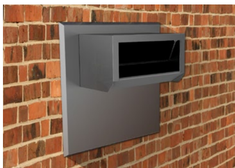
No lock drive-up front

Whether it be a drop-and-go option that allows busy families to return multiple items at once or a drive-up option that provides ultimate convenience on weekends, flex bookDrop is completely customizable to meet your operating objectives. With many front-end and back-end options, we welcome the opportunity to guide you through which features make sense for your space, workflow, staff needs and user expectations.