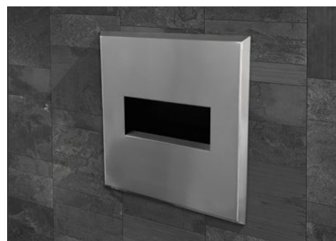
Manual flat front